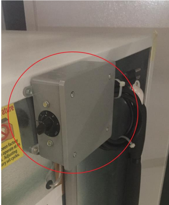
Mechanical Temperature Controller – located in the rear top location of refrigerator or freezer.

After making an adjustment, please allow 8 hours' operation before making a new adjustment.