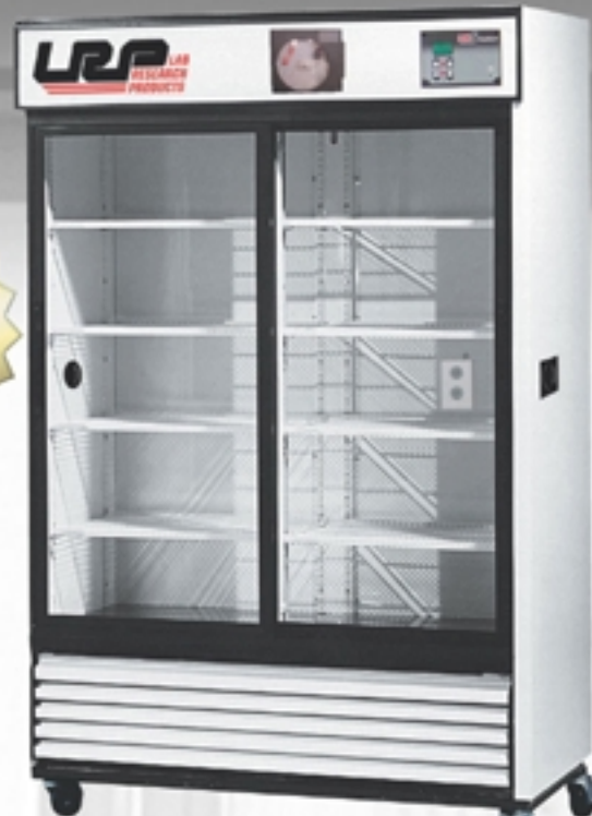
(CRP-47) SHOWN WITH OPTIONAL CHART RECORDER