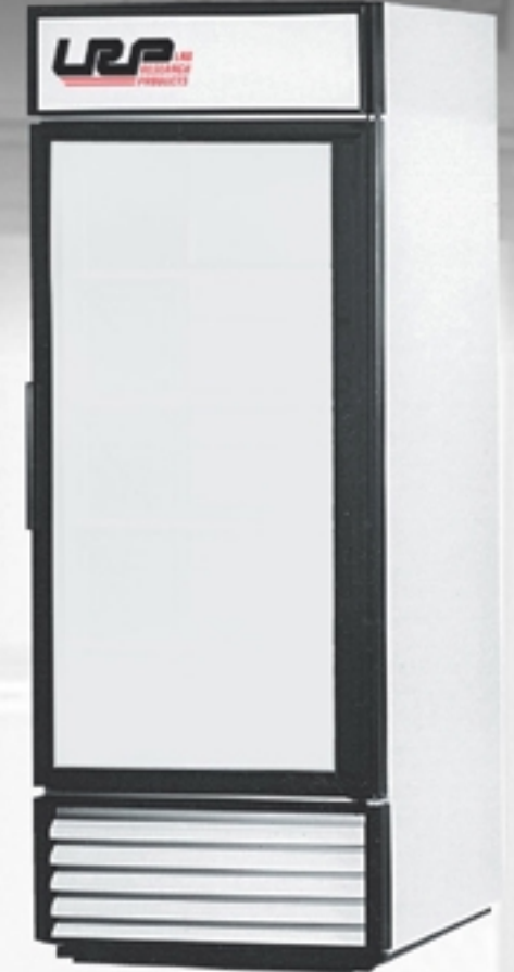
(CRB-26) SHOWN WITH OPTIONAL SOLID DOOR CONVERSION